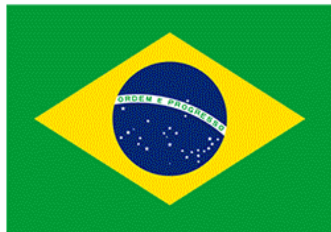
Sao Paulo, Brazil