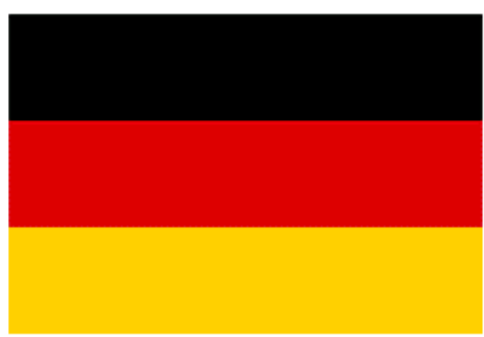
West Berlin, Germany